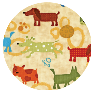
AQK-7820-169 Earth 1/2 yard