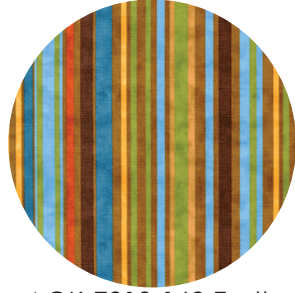
AQK-7818-169 Earth 1/3 yard