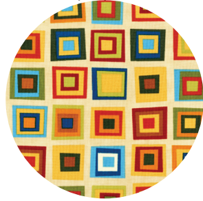
AQK-7811-169 Earth 5/8 yard