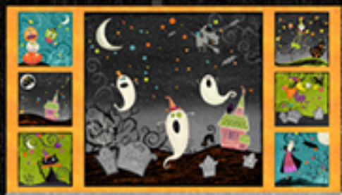
Fabric A (24" x 43")