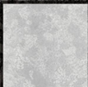
Fabric H Q1817-39064-990