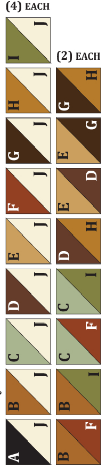
FOR VANILLA QUILT