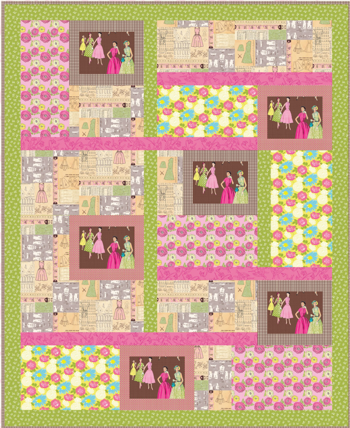
Quilt Design by Metropolitan Quilt

Vintage ladies and sewing patterns, novel geometrics and whimsical florals combine to create this fun and flirty fabric collection. A fabulous mix of patterns in two vibrant color palettes. See the entire Homespun Chic Collection on our website: www.blendfabrics.com