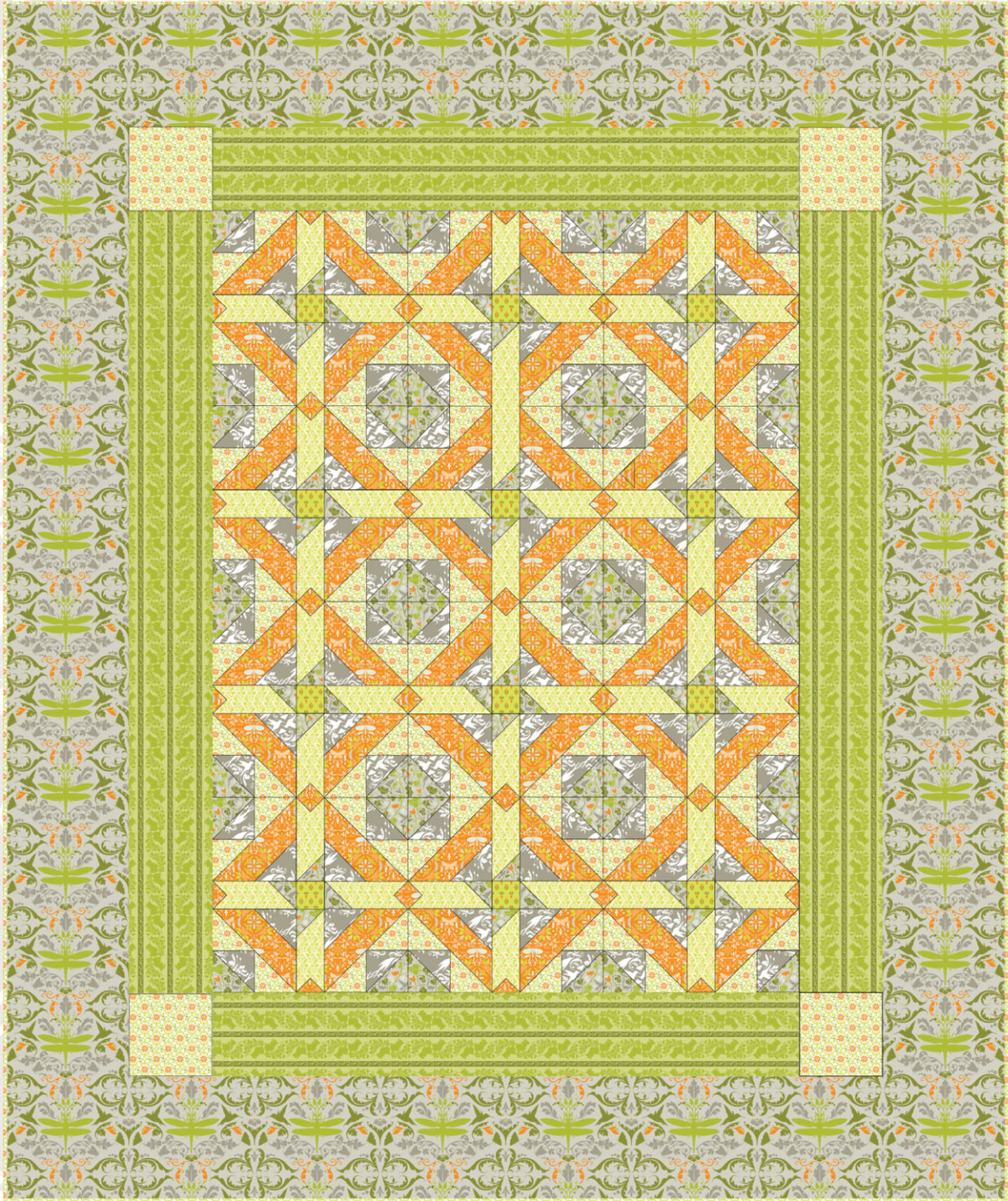
Quilt Design by Metropolitan Quilt

A fresh and modern fabric collection inspired by nature's simplicity. Hummingbirds, dragonflies, bees and flowers all join together in this dynamic celebration of print and color. See the entire Garden of Delights Collection on our website: www.blendfabrics.com