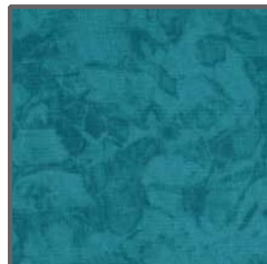
K4165 Krystal 7/8 yard