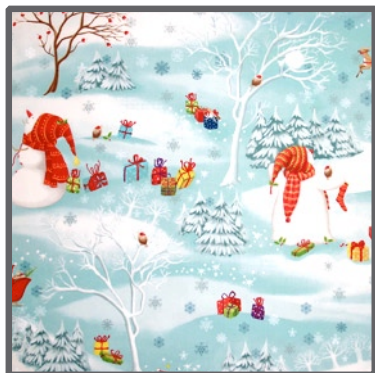
CX4642 Sky Snowman's Land 1 1/2 yards