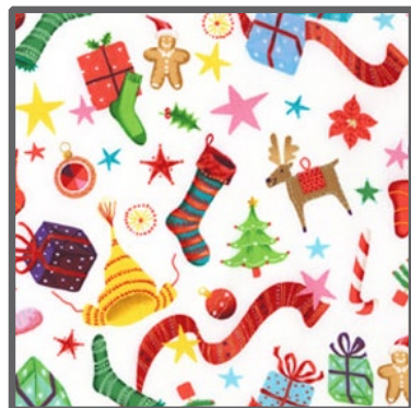
CX4643 Multi Stocking Stuffer 3/8 yard