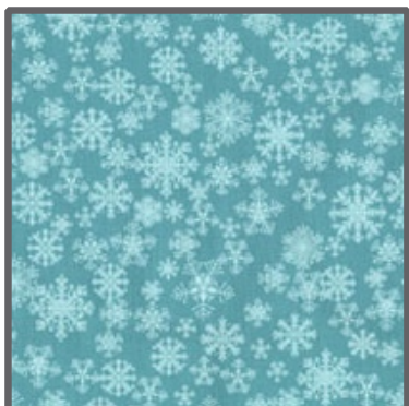
CX4644 Turquoise Snowfall Fat 1/4