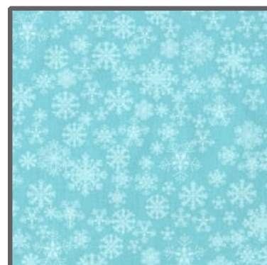
CX4644 Sky Snowfall 3/4 yard