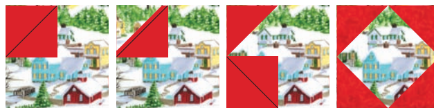
Make 18 "Picture" Blocks. Each block should measure 5\frac{1}{2}" \times 5\frac{1}{2}"